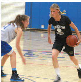
Girls b-ball swishes through summer. Sports, B12