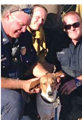
Firefighters help rescue local dog. B6