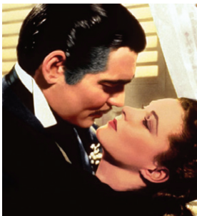
Reflecting on 'Gone With the Wind.' Reel Family Reviews, B6