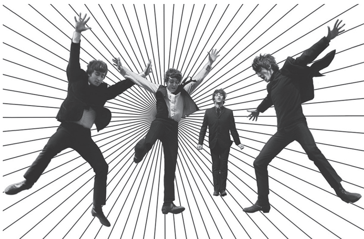
A fully restored version of "A Hard Day's Night" will screen in Malibu on Aug. 8-9.