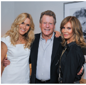
Foundation marks five years since Fawcett's death. Malibu Seen, B2