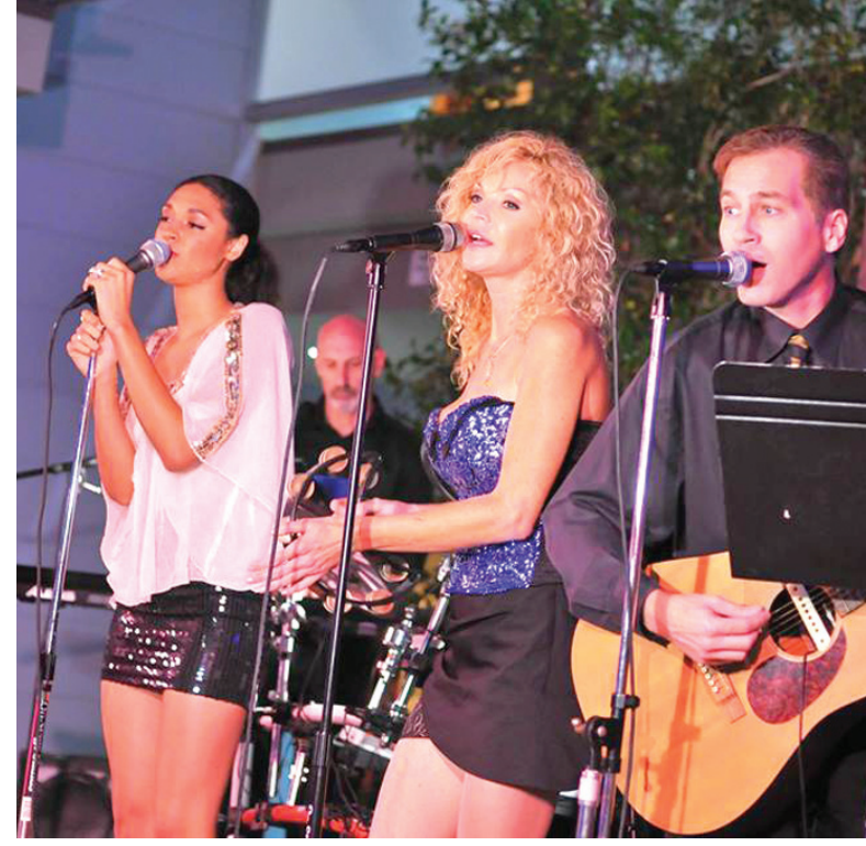
Dance along to Something Hot as they play all afternoon this Saturday at Rosenthal - The Malibu Estate.

Thurs.: Experimental Thursdays featuring live music by The Hills of Malibu with half price pizza r&d&e specials. 8 p.m. - 10 p.m. Call for details.