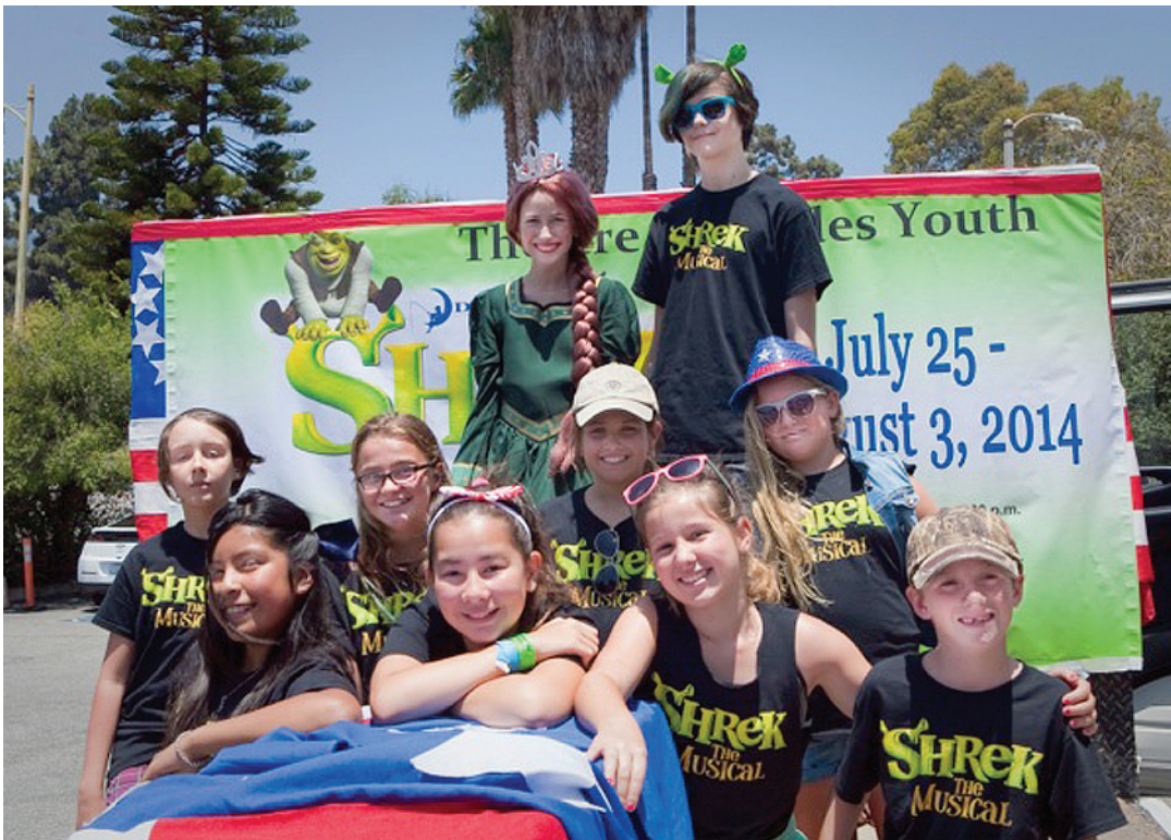
Two Malibu actors are part of the Theatre Palisades Youth production "Shrek The Musical," which promoted its show at the Palisades Fourth of July Parade.

Theatre Palisades Youth participated in the Palisades Fourth of July Parade, promoting its upcoming production, "Shrek The Musical." Two Malibu