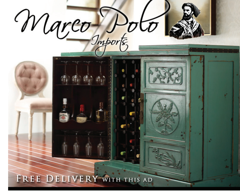
PURVEYORS OF FINE EXOTIC SUSTAINABLE FURNISHINGS SINCE 1998

Malibu book discussion group meets Wednesdays, at Point Dume Clubhouse, 1 p.m. 310.456.6139