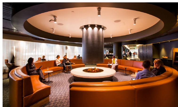
Travelers can enjoy the comfort of the Qantas Business lounge in the Tom Bradley Terminal at LAX.