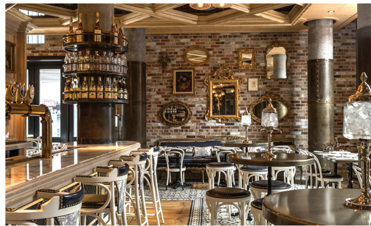
The Cluny in Toronto's historic Distillery District