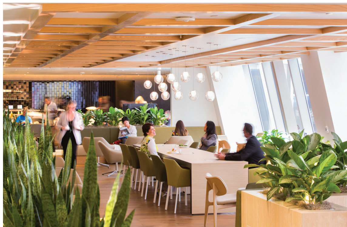
The new restaurant in the Qantas Business lounge offers a menu fusing Asian and Western flavors.

Another dining design worth visiting is the Cluny, the latest