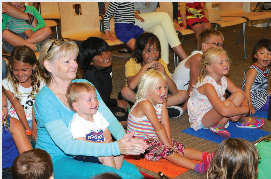
Children and their families gathered for Swazzle Puppet Companies presentation of "B.A.R.K. the Robot Dog" in the Community Room at the Malibu Library.