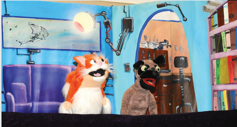
Above: Rachel the Cat and Rivet the Dog delight the children at the Malibu Library on Monday afternoon.