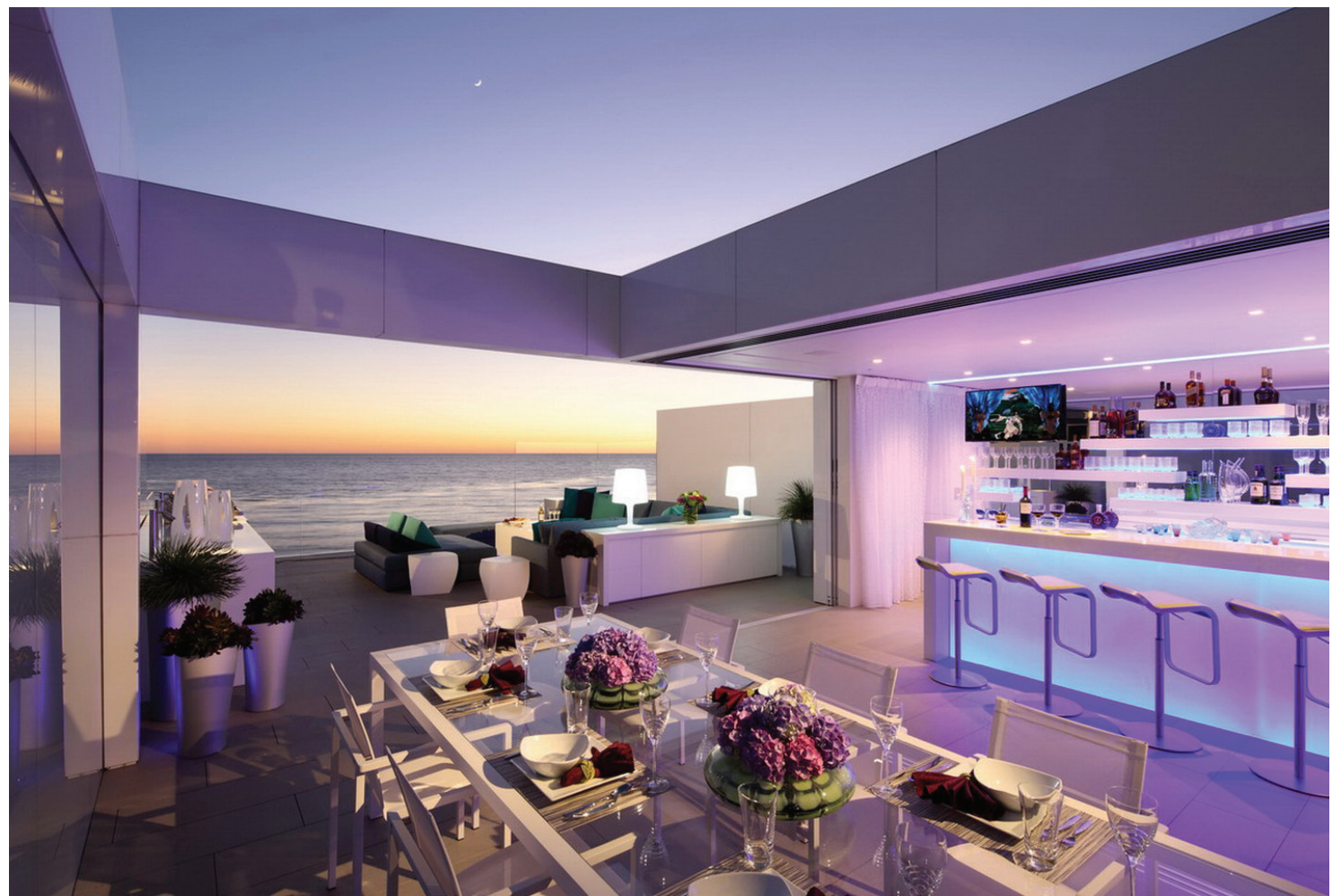
Above: The Sea Level residence, located in Malibu, took home the Merit Award for a Renovated or Restored Project.