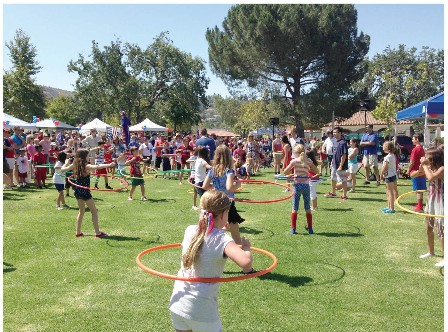
The City of Westlake hosts its annual Fourth of July parade and are joined this year by the Malibu/Lost Hills Sheriff's Station.

The Malibu/Lost Hills Sheriff's Station participated in the City of Westlake's 45th Annual Fourth of July