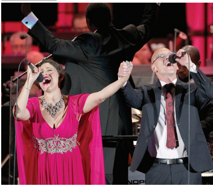
Pink Martini rocks the Hollywood Bowl to raise money for charity.