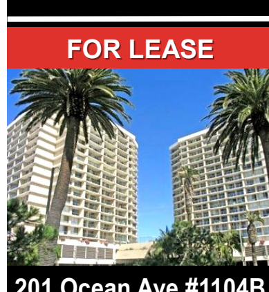
201 Ocean Ave #1104B Santa Monica

BreathtakingOcean views! 1ST class full service Bldg. 3BR/2.5BA, Hardwood & Stone, Viking Appliances. $9,000/month