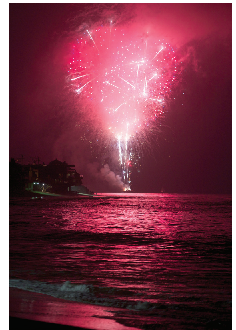
Fireworks could be seen from several spots off the Malibu coast.