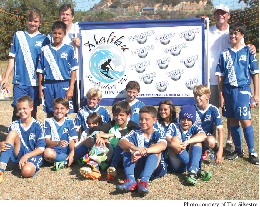
Malibu Surfriders FC

Eight teams advanced into the championship tournament on July 5, including Malibu. Despite leading 5-1 in the third quarter, the Surfriders succumbed to the eventual U-12 champions, Rowland Heights. The game was tied, 5-5, after regulation and Rowland Heights advanced on penalty kicks, 4-3.