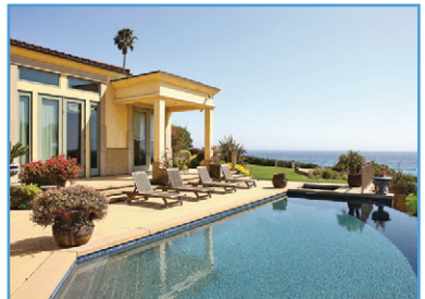
Gorgeous White Water Views from Custom Italian Villa $6,750,000