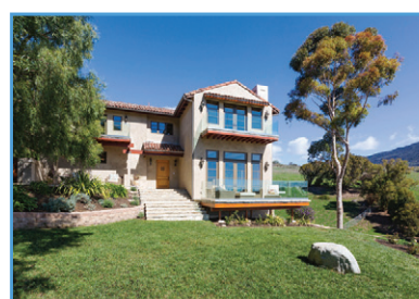
Desirable Malibu Park with Ocean and Mountain Views $2,295,000