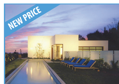
Stunning Ocean View Architectural w/Pool & Spa $3,650,000