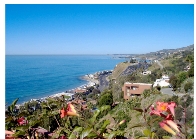
Views from Palos Verdes to Pt. Dume whales and Dolphins too!

3 Bedroom, 4 Bath Home in Beautiful, Close-in, La Costa, Malibu