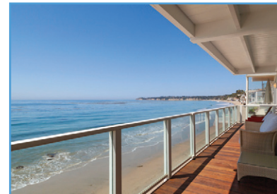
Custom Remodeled Beach-Front Home on Malibu Cove Colony Beach $6,545,000