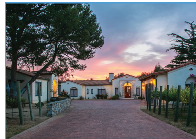
Extraordinary Point Dume Compound w/Guest Hse, Pool & Pinot Noir Vineyard $6,400,000