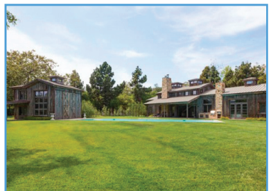
Malibu Farmhouse: 5 BR Estate on aprx. 2 Acres w/Pool $6,450,000