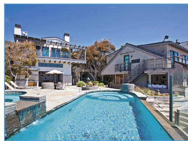
Magnificent Architectural 5BD Home on 80' of Sandy Broad Beach Frontage w/Ocean-Front Pool $14,000,000 Also For Lease