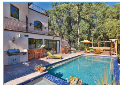
Gorgeous 5 BR Tuscan Villa w/Pool, Spa, Cabana $4,250,000 Also for Lease