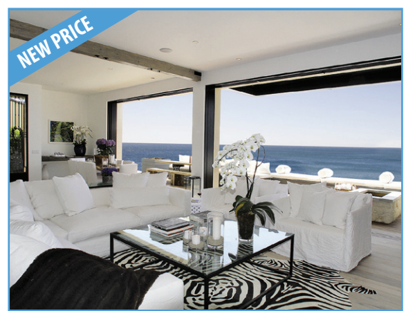
The Stone House. The Ultimate Beach House, on Approx. 50' of Sandy Beach. Live the Malibu Dream! $9,985,000