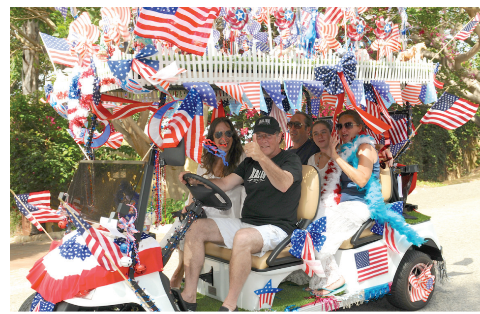
Parade participants decked their golf carts out with a variety of red, white and blue items including flags, pinwheels, banners and streamers.