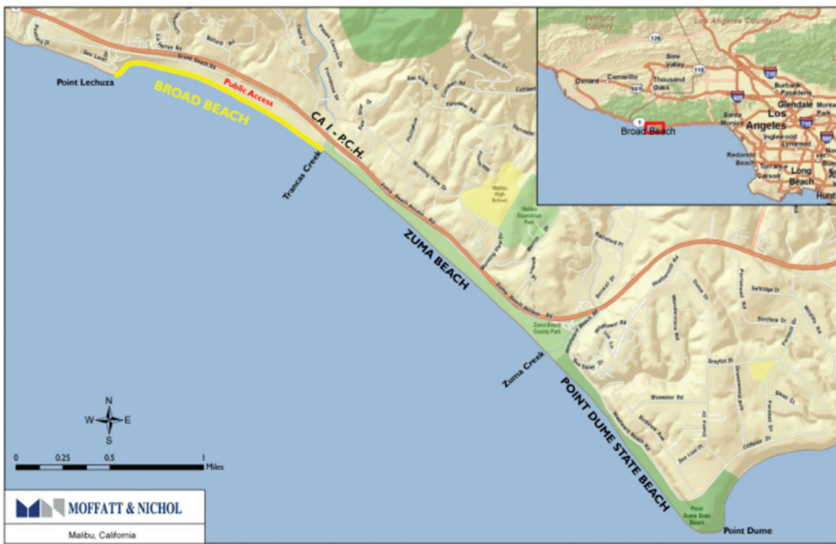
An application to replenish the heavily eroded Broad Beach (highlighted above in yellow) has been deemed complete by the State Lands Commission and the California Coastal Commission. The application should be placed on a CCC agenda in the next six months.