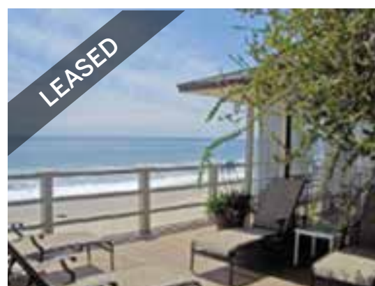
La Costa Beach | $12,000/mo