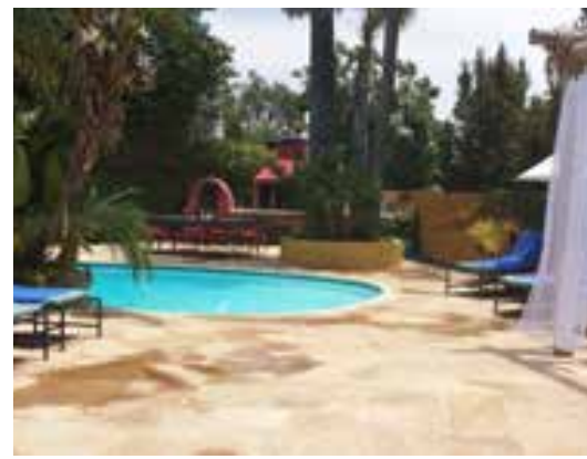
Bunnie Lane | $2,425,000