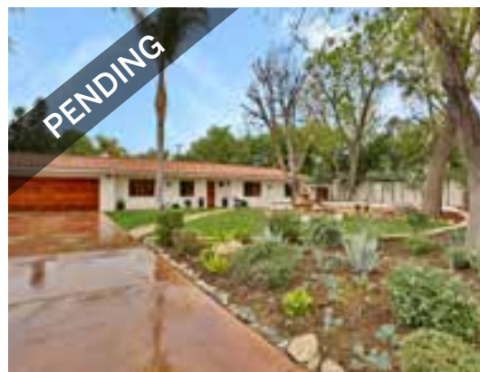
Spanish Ranch | $969,000