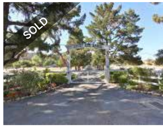
Lucky Ranch | $2,595,000