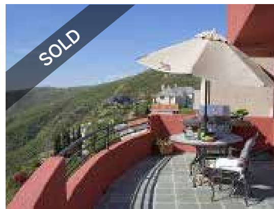
Corral Canyon | $1,000,000