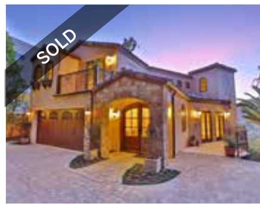
Serra Retreat | $2,595,000