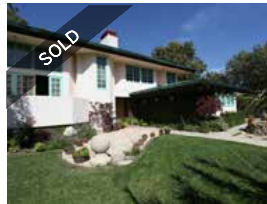
Malibu West | $1,895,000