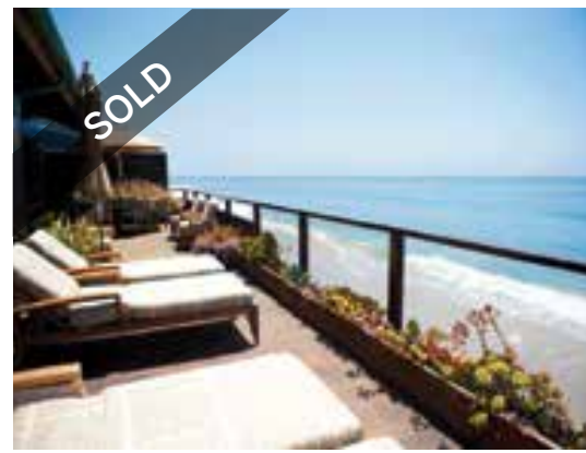
Malibu Road | $7,200,000