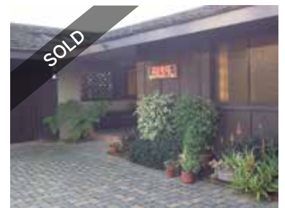
Playa Del Rey | $1,295,000