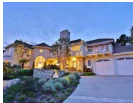
Malibu Country Estates | $3,150,000