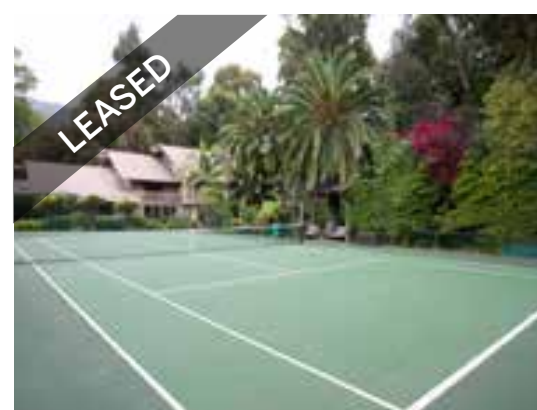
Serra Retreat | $13,500/mo