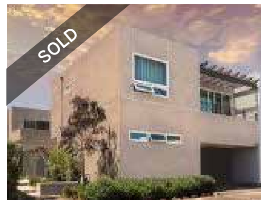
Reef Way | $949,000