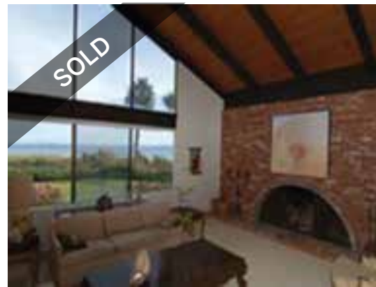
Malibu Country | $1,500,000