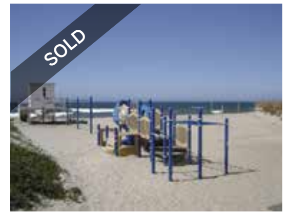
Malibu West | $1,949,000