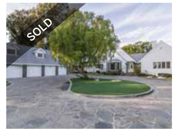
Point Dume | $4,295,000