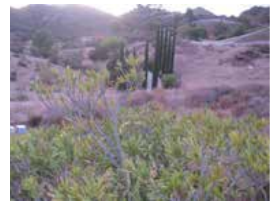
Mulholland Lot | $549,000