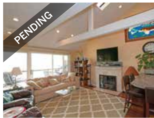
Las Tunas Beach | $2,895,000