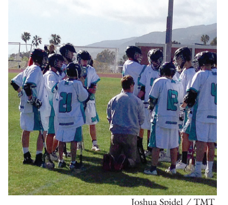
The Sharks lacrosse team talks strategy during a game against West Ranch.

After the quick start, the time of possession evened out in the second as both