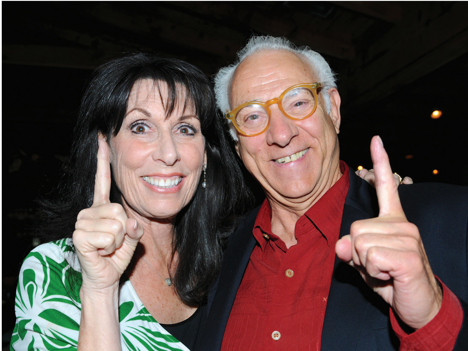
Julie Ellerton / TMT

"I am delighted to be able See Election results, page A10