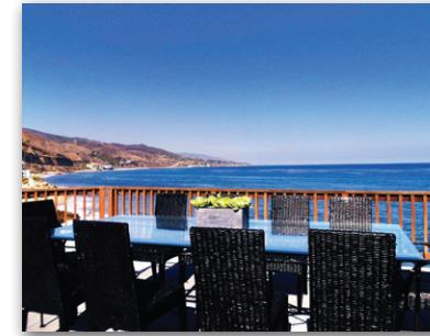
PRIVATE BEACH COVE Once in a lifetime opportunity to own apx. 90' of beach frontage in Latigo Shore. $5,875,000 | 2B/2.5B | Malibu Brant Didden