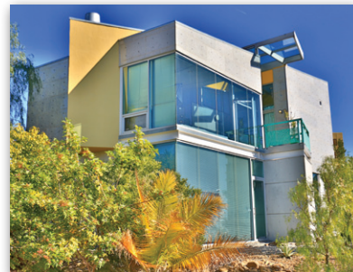
OCEAN VIEW ARCHITECTURAL Extensive ocean, coastline & mountain views on apx. 5 acres. Separate theater room, pond, tennis court, 4-car garage. $3,395,000 | 5B/8B | Malibu Brant Didden & Bobby Lehmkuhl