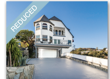
UPPER PASEO MIRAMAR Views, views, views! Private & remodeled from top to bottom. Incredible coastline & city light views. Pacific Palisades $2,588,000 | 3B/3B Brant Didden