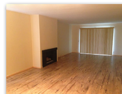
MALIBU GARDENS Updated corner unit. Oversized brick patio. Community pool & clubhouse. Fireplace. $2,800/mth | 2B/2B | Malibu Danielle Dutcher