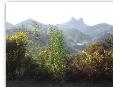
VIEWS OF TURTLE MOUNTAIN Amazing sunset views. Apx. 5 acres. Very easy access & all utilities close to Kanan Dume. $199,000 | Malibu Bobby Lehmkuhl & Brant Didden