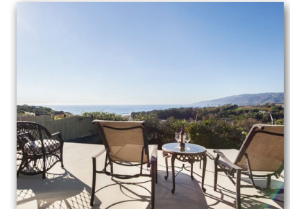
POINT DUME CLUB Sweeping whitewater & mountain views. Sits along the perimeter rim. Huge viewing deck. $1,095,000 | 3B/3B | Malibu Brant Didden & Johnny Steindorff