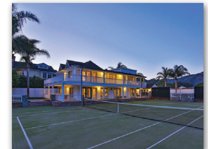
MALIBU COLONY BEACH Quintessential furnished beach house. Tennis court, pool, spa, studio guest house. On a double lot. $32,500/mth | 4B4.5B | Malibu Eytan Levin