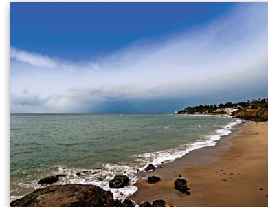
CORRAL BEACH GETAWAY Dramatic coastline & island views. Wrap around deck. Secluded dry beach. Underground parking. $4,395,000 | 3B/2B | Malibu Brant Didden