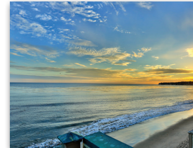
ESCONDIDO BEACH Location, location, location. Outstanding unobstructed views. $8,900,000 | 3B/4B | Malibu Brant Didden