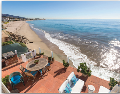
OUTSIDE THE COLONY GATE Huge master suite. Spacious & private. Views of Colony Beach & city lights. Great location on "the Road." $9,750,000 5B/6B | Malibu Eytan Levin