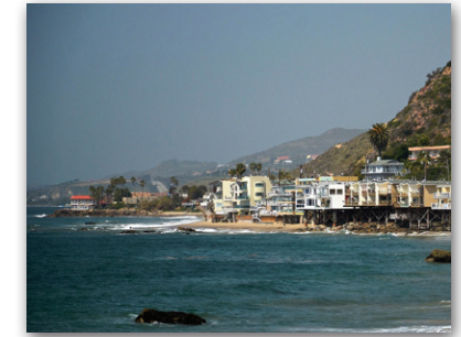
BIG ROCK BEACH TRI-PLEX Located on apx. 100' of beach frontage. Recently remodeled. Expansive decks perfect for entertaining. $4,995,000 | 3B/3B | Malibu Brant Didden