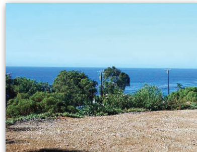
RARE LAND OPPORTUNITY All utilities in; electric, water, 10,000 gallon water tank, propane, septic system. Apx. 1.2 acres. $790,000 | Malibu Sandra Peltola