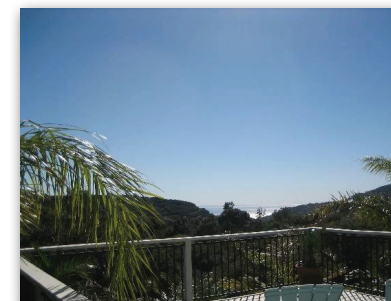
OCEAN & MOUNTAIN VIEWS On over 8 acres. Guest house. Large, flat pad perfect for horses. $1,270,000 | 3B/2B | Malibu Sue Varga