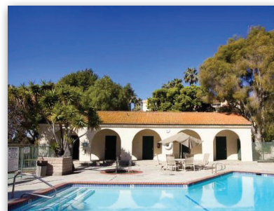
MALIBU GARDENS Upper corner unit. Upgraded & well maintained. Wood burning fireplace. Private. Views of lush greenery. $569,000 | 2B/2B | Malibu Jill Reeder