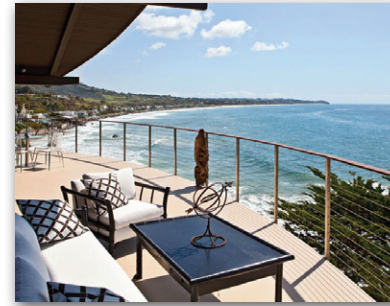
BROAD BEACH BLUFF Harry Gesner architectural on a private, secluded cove. Incredible ocean views! Gated street. $6,500,000 | 3B/3.5B | Malibu Brant Didden