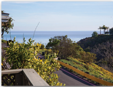
PARADISE COVE Amazing outer perimeter location. Completely remodeled to perfection. Ocean & mountain views. $2,795,000 | 3B/4B | Malibu Eytan Levin