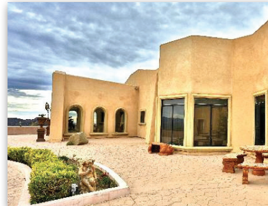
CELEBRITY-OWNED COMPOUND Private enclave on apx. 20 acres with 2 guest houses, a separate sound studio, horse facilities & helipad. $1,975,000 | 11B/7B | Acton Scott Gahret & Jim Fairbanks