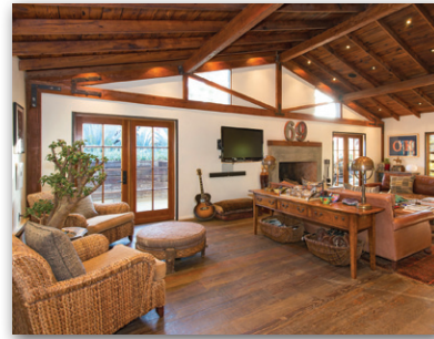
EQUESTRIAN DREAM PROPERTY Prime Winding Way location with 2 parcels totaling over 6 acres. Nestled between park land & riding trails. $8,900,000 | 5B/4B | Malibu Eytan Levin