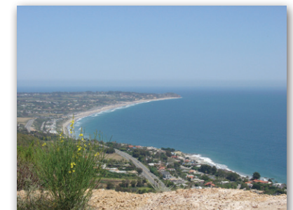
28+ ACRE ESTATE SITE Incredible views & privacy. Geology & soils reports available. Plans for an apx. 8,000 sq. ft. home. $3,650,000 | Malibu Brant Didden