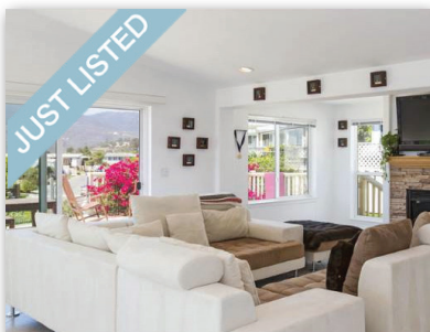
POINT DUME CLUB Spectacular, unobstructed panoramic ocean & mountain views. Open floor plan. Exclusive guard, gated community. $725,000 | 3B/2B | Malibu Sue Varga