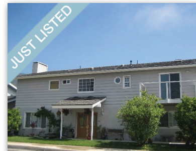
MALIBU WEST TRADITIONAL Fantastic mountain, canyon & ocean views. Walking distance to dog park, private beach club and new Trancas shopping center. $1,400,000 | 5B/3B | Malibu Sue Varga