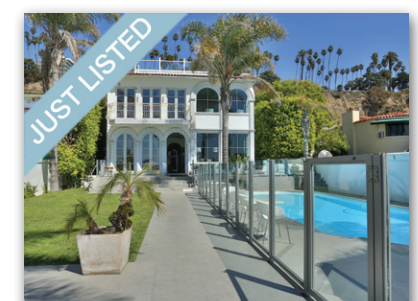
PALISADES BEACH ROAD One of a kind estate. Private entry courtyard. Pool, spa, BBQ, grassy yard. Underground garage for 6 cars. $50,000/mth | 10B/12B Monique Jelley & Eytan Levin