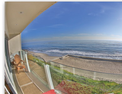
MALIBU BAY CLUB Recently remodeled, turn-key beach home. Lower guest quarters with sand level entrance. $2,995,000 | 2B/3B | Malibu Brant Didden