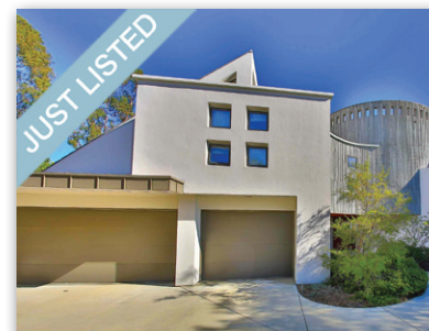
MARSHALL LEWIS AIA ARCHITECTURAL On apx. 4.5 private acres. Stunning 270 degree city light & ocean views. Detached office / guest space. Flat useable land. $2,875,000 | 4B/3B | Malibu Brant Didden