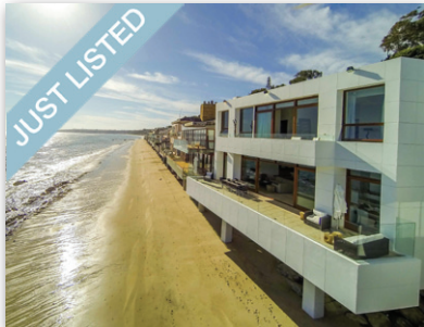
MALIBU COVE COLONY Contemporary beach house on apx. 50' of frontage. 24-hour guard-gated cul-de-sac. Coastline views. $8,295,000 | 6B/6B | Malibu Brant Didden