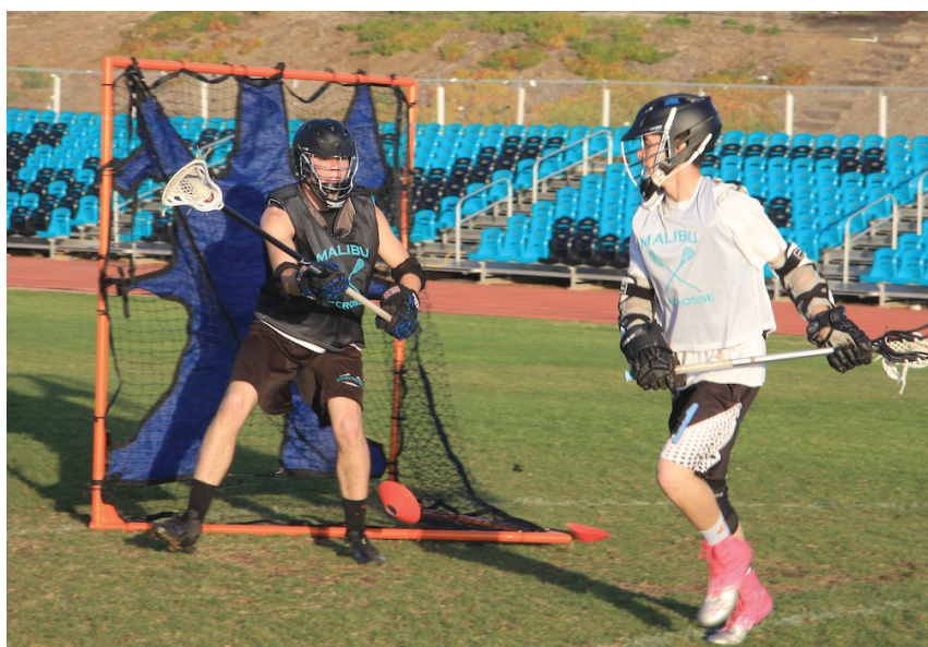
Dick Dornan / TMT