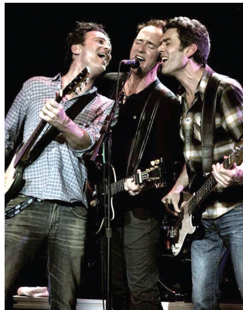
See Tonic at The Canyon Club this Friday.

THE LAB BREWING COMPANY 30105 Agoura Road, Agoura Hills. 818.735.0091 Thurs.: Firestone Big Beer Night and Experimental Thursdays featuring Live music by The Hills of Malibu and special guest artists. 8 p.m. - 11 p.m. Call for details.