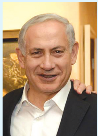
Israeli PM Benjamin Netanyahu motorcade to cause PCH delays

The top stories on MalibuTimes.com this week