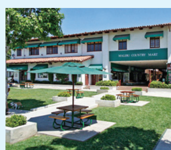
Rob Reiner group proposes initiative to curb chain stores in Malibu