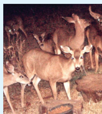
Deer killings worry Big Rock neighbors