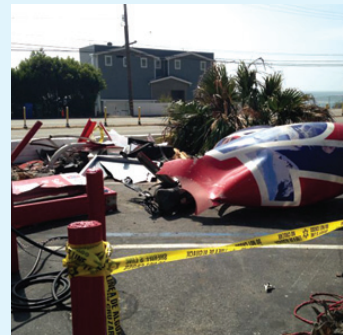
Photos: Car plows through 76 gas station sign