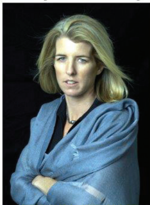
Producer/director Rory Kennedy will join us for an audience Q&A after the screening.

ONE SHOW ONLY: SATURDAY, MARCH 22 ND - 7:30