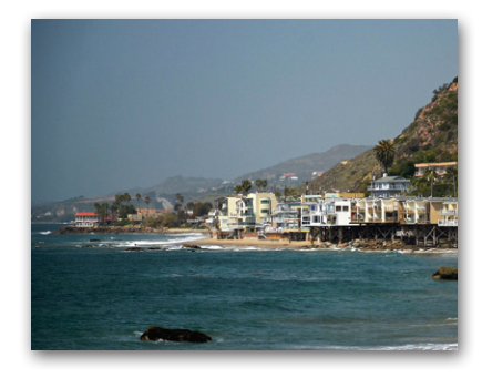
BIG ROCK BEACH TRI-PLEX Located on apx. 100' of beach frontage. Recently remodeled. Expansive decks perfect for entertaining. $4,995,000 | 3B/3B | Malibu Brant Didden