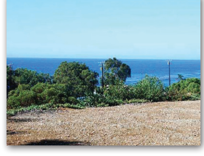
RARE LAND OPPORTUNITY All utilities in; electric, water, 10,000 gallon water tank, propane, septic system. Apx. 1.2 acres. $790,000 | Malibu Sandra Peltola