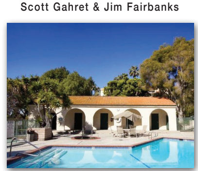
MALIBU GARDENS Upper corner unit. Upgraded & well maintained. Wood burning fireplace. Private. Views of lush greenery. $569,000 | 2B/2B | Malibu Jill Reeder