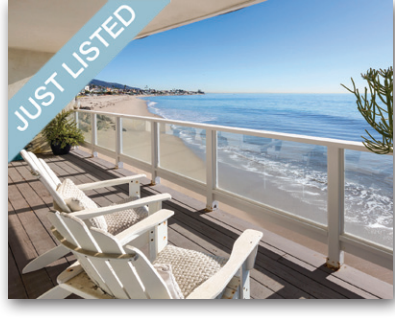
PRIME MALIBU ROAD Just outside the Colony gate. Huge master with updated master. Ocean front decks. Furnished. $23,900/mth | 5B/6B | Malibu Eytan Levin & Monique Jelley