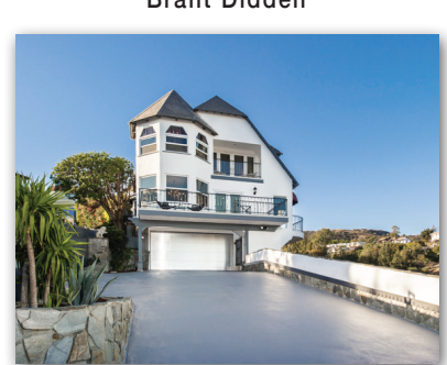
UPPER PASEO MIRAMAR Views, views, views! Gated & remodeled from top to bottom. Incredible coastline & city light views. Pacific Palisades $2,795,000 | 3B/3B Brant Didden