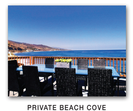
Once in a lifetime opportunity to own apx. 90' of beach frontage in Latigo Shore. $5,875,000 | 2B/2.5B | Malibu Brant Didden