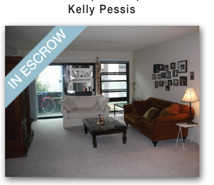
CROSS CREEK VILLAGE Light & bright unit. Resort-style complex with 2 pools, fitness center, tennis & basketball courts. $249,500 | 1B/1B | Play del Rey Danielle Dutcher