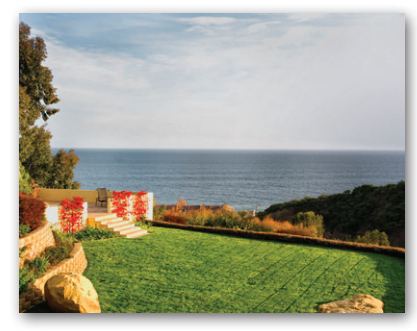
LAS FLORES CANYON Glittering ocean & mountain views. Chef's kitchen. Spa. Courtyard. Great for entertaining. $4,275,000 | 4B/5.5B | Malibu Eytan Levin