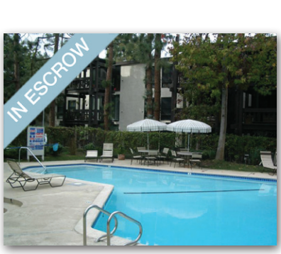
CROSS CREEK VILLAGE Resort-style living in a fully gated complex with many amenities. Top floor unit. Open living area. $449,000 | 2B/2B | Play del Rey Bobby Lehmkuhl