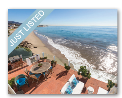
OUTSIDE THE COLONY GATE Huge master suite. Spacious & private. Views of Colony Beach & city lights. Great location on "the Road." $9,750,000 5B/6B | Malibu | Eytan Levin