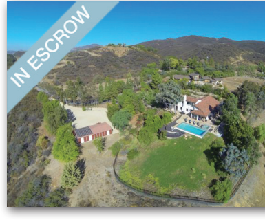
MULHOLLAND HORSE PROPERTY Spectacular views. Recently renovated. Barn w/stalls, tack room, wash rack & riding ring. $1,695,000 | 4B/3.5B | Malibu Bobby Lehmkuhl