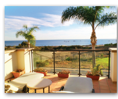
LUNITA Turn-key front row unit. Spectacular ocean views. Light & bright. Walk to new Trancas shopping center. $1,350,000 | 2B/3B | Malibu Brant Didden