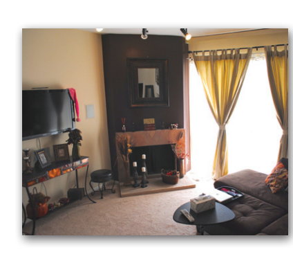
MALIBU VILLAS Furnished end unit. Private patio, central A/C & ample storage space. Walk to Paradise Cove. $3,750/mth | 2B/2.5B | Malibu Brant Didden & Monique Jelley