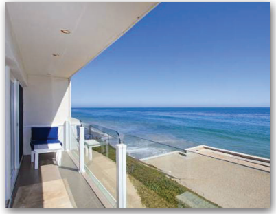
MALIBU BAY CLUB Recently remodeled, turnkey beach home. Lower guest quarters with sand level entrance. $3,095,000 | 2B/3B | Malibu Brant Didden