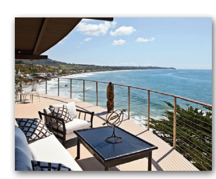
BROAD BEACH BLUFF Harry Gesner architectural on a private, secluded cove. Incredible ocean views! Gated street. $6,500,000 | 3B/3.5B | Malibu Brant Didden