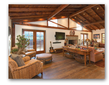
EQUESTRIAN DREAM PROPERTY Prime Winding Way location with 2 parcels totaling over 6 acres. Nestled between park land & riding trails. $9,875,000 | 5B/4B | Malibu Eytan Levin