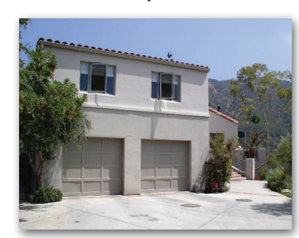
SHORT-TERM RENTAL Overlooking Las Flores Canyon. La Costa Beach & Tennis Club Rights. Extremely private. Furnished. $7,000/mth | 4B/2.5B | Malibu Monique Jelley | Eytan Levin