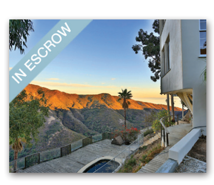
OCEAN & CANYON VIEWS Close-in & minutes to the beach. Large window & volume ceilings. Open floorplan. Large deck with pool. $1,375,000 | 4B/4B | Malibu