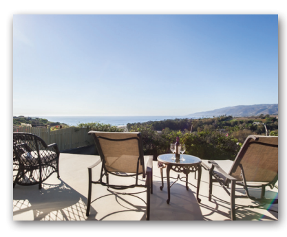
POINT DUME CLUB Sweeping whitewater & mountain views. Sits along the perimeter rim. Huge viewing deck. $1,195,000 | 3B/3B | Malibu Brant Didden & Johnny Steindorff