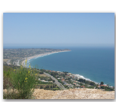
28+ ACRE ESTATE SITE Incredible views & privacy. Geology & soils reports available. Plans for an apx. 8,000 sq. ft. home. $3,995,000 | Malibu Brant Didden