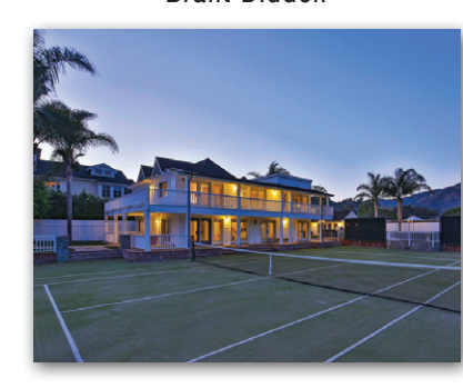
MALIBU COLONY BEACH Quintessential furnished beach house. Tennis court, pool, spa, studio guest house. On a double lot. $32,500/mth | 4B4.5B | Malibu Eytan Levin