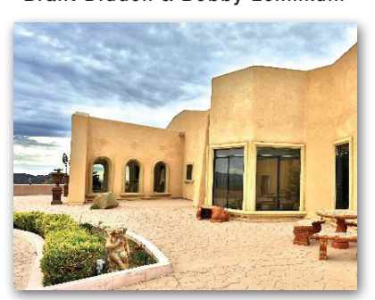
CELEBRITY-OWNED COMPOUND Private enclave on apx. 20 acres with 2 guest houses, a separate sound studio, horse facilities & helipad.