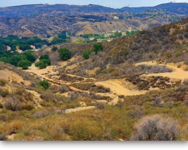
PRESTIGIOUS PLACERITA CYN. 3 parcels on apx. 7.5 acres. Reports available with accepted offer. Great opportunity to build your dream home. $299,000 | Newhall Scott Gahret