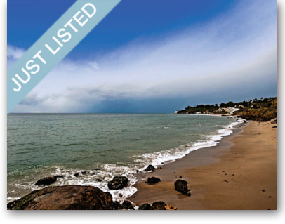
CORRAL BEACH GETAWAY Dramatic coastline & island views. Wrap around deck. Secluded dry beach. Underground parking. $4,395,000 | 3B/3B | Malibu Brant Didden