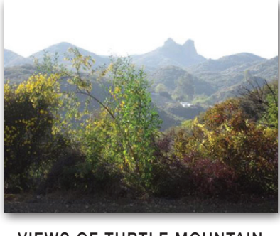
VIEWS OF TURTLE MOUNTAIN Amazing sunset views. Apx. 5 acres. Very easy access & all utilities close to Kanan Dume. $199,000 | Malibu Bobby Lehmkuhl & Brant Didden