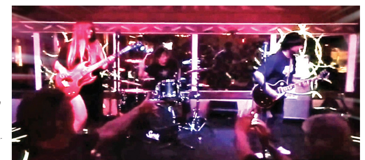
Check out Karma Dealers as they perform their new song, "I am a Dolphin" at The Carpe Deim Show at The Sunset Restaurant this Saturday.