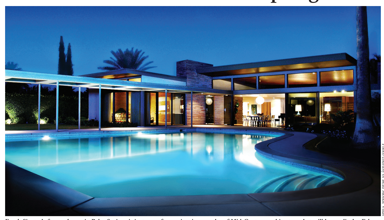
Frank Sinatra's former house in Palm Springs is just one of many iconic examples of Mid-Century architecture that will be on display Feb. 13-23 during the annual Modernism Week festival.