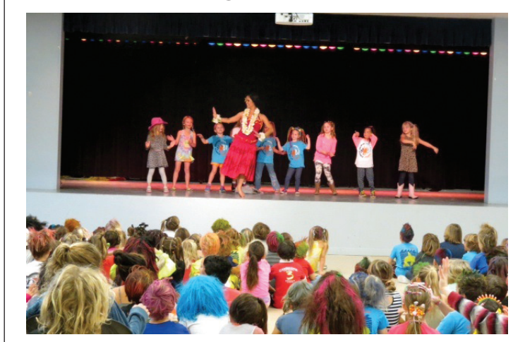
Students at Point Dume Marine Science Elementary School had the opportunity to watch Polynesian dancers at an assembly last week.