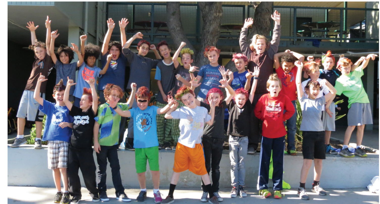
Point Dume Marine Science Elementary School students had a chance to show off new, temporary hairstyles on "Crazy Hair Day."