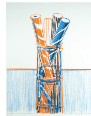
"Glassed Candy," by Wayne Thiebaud, is one of many pieces on display at Pepperdine's new Thiebaud exhibit.