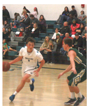
Malibu High hoops fall in dramatic opener. Sports, B12