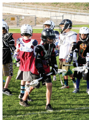
City to hold youth lacrosse clinic. Sports, B12