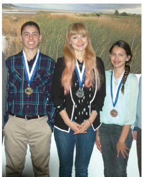
Students win essay contest. People, B2