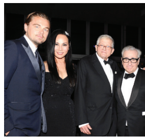
Malibu celebs take home Golden Globes. Malibu Seen, B2