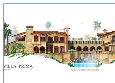
Two Gorgeous Legal Parcels w/Ocean Views, Plans. $5,750,000