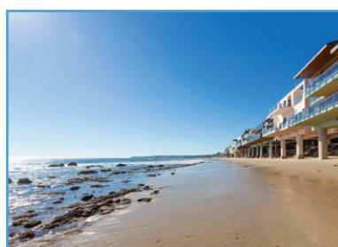
Oceanfront Architectural in Malibu Cove Colony. $24,000/month