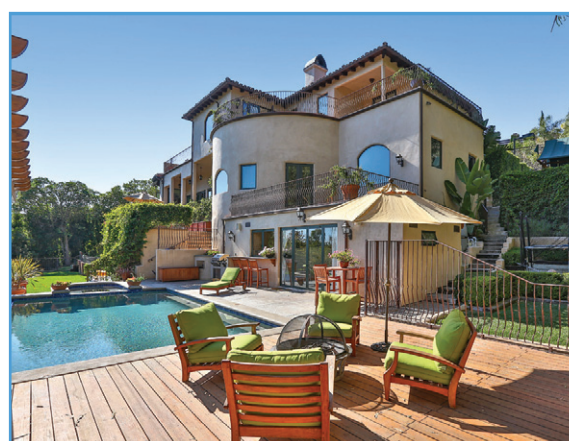
Custom 5 BR Tuscan Villa in Beautiful Private Setting. $4,750,000