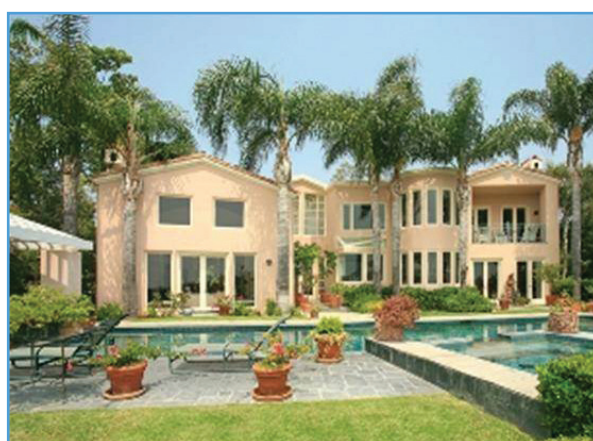
Spacious Contemporary Mediterranean w/Pool, Spa, Gardens. $4,295,000