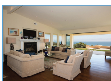
Beautiful One Story Ocean View Mediterranean. $7,000/month