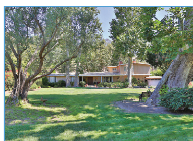
Charming 4BR Home on Aprx 1.2 Landscaped Acres. $3,250,000