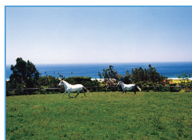
Aprx 4 Acre Knoll-Top w/Plans, Permits, Views! $2,995,000