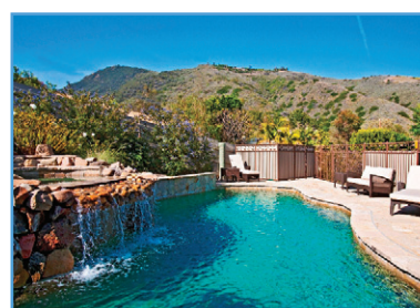
Stunning Architectural Home on Aprx 2 Private Acres. $2,595,000