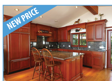
"A Place in the Sun" 3 BR on Broad Beach Rd. $2,150,000