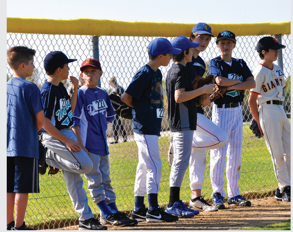
Malibu Little Leaguers take a break while they wait for the next phase of tryouts.