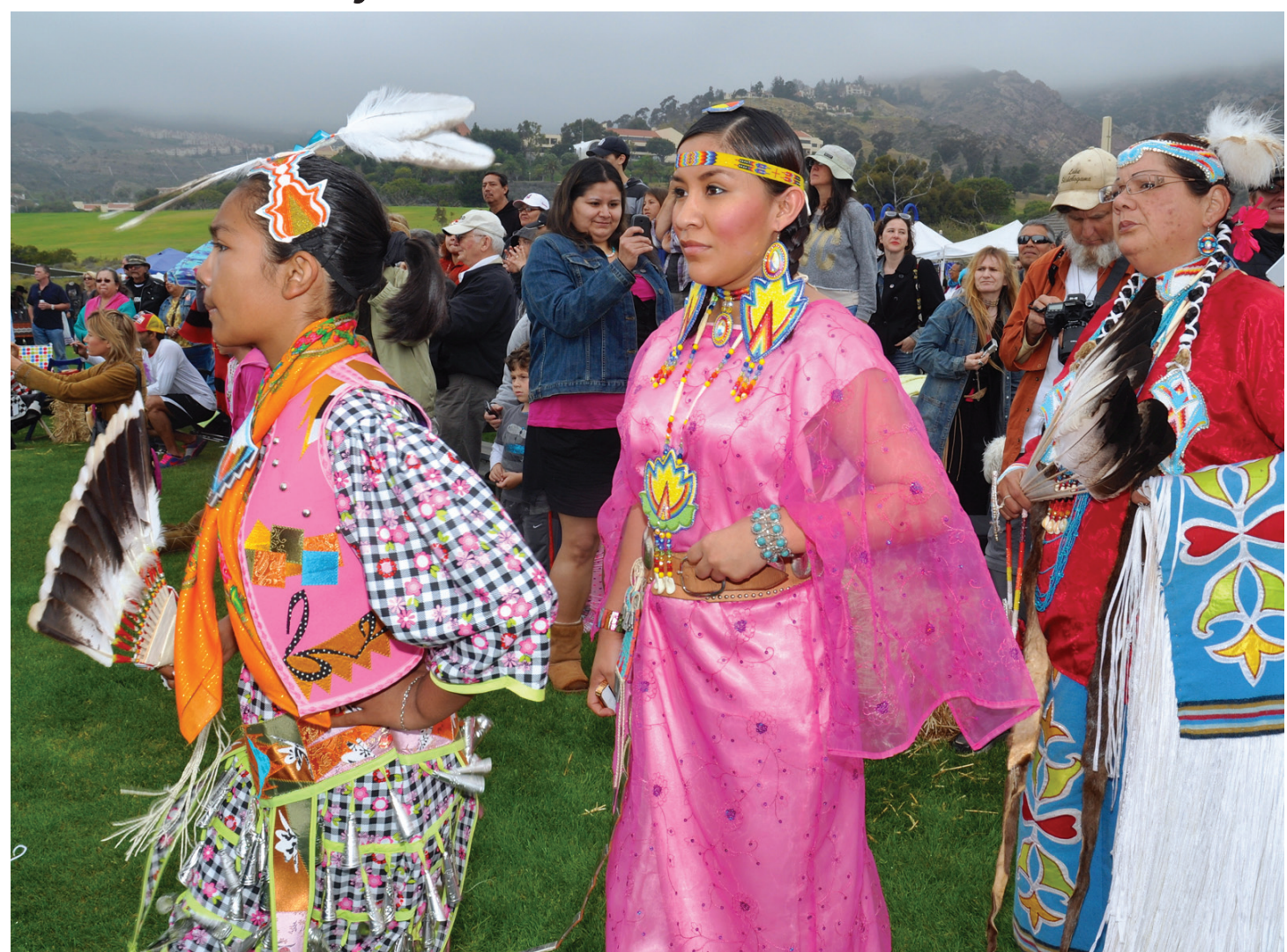
Hundreds of Malibu residents and visitors visited Bluffs Park to witness the ceremonial Grand Entrance. Native Americans from all over the United States wore their traditional clothing representing their tribe during Chumash Days this year.