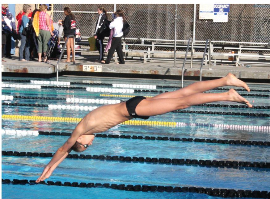
Dick Dornan / TMT

Logan Hotchkiss competes at a swimming invitational at East LA college Dec. 20-22.